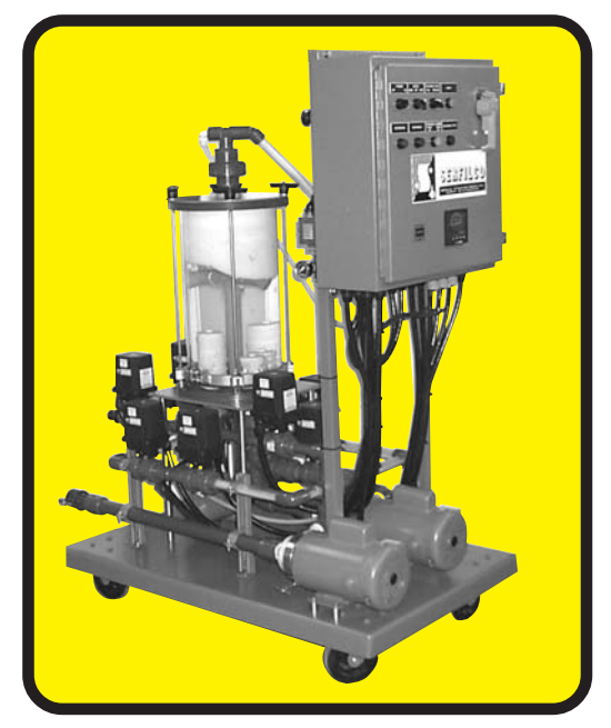
Pilot unit available for rental. Consult Sales Dept.